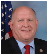
Rep. Glenn “GT” Thompson (R-PA-15) Co-Chair