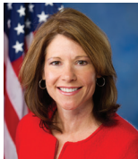
Rep. Cheri Bustos (D-IL-17) Co-Chair

In July, Rep. Cheri Bustos (D-IL-17) and Rep. Glenn “GT” Thompson (R-PA-15) launched the Congressional Crop Insurance Caucus to help Members of Congress and their staff better understand the program and build bipartisan support for this critical risk management tool for farmers and ranchers. To date, there are 38 members of the caucus.